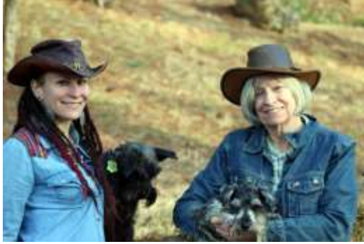
Here's the "cowgirls" with the "little doggies".