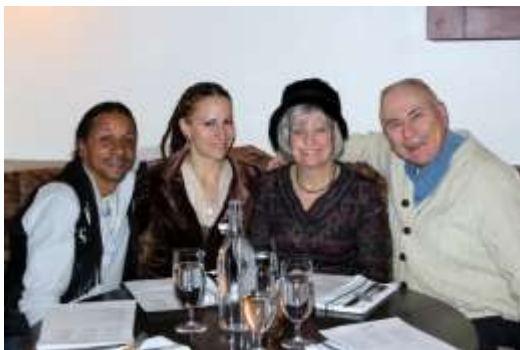
And here we are out for our 44 th anniversary dinner.